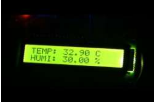
Fig- Reading of Display