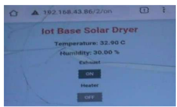
Fig. Reading of Cell Display